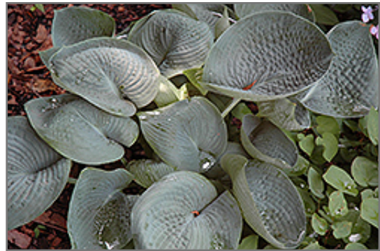
Abiqua Drinking Gourd Hosta foliage