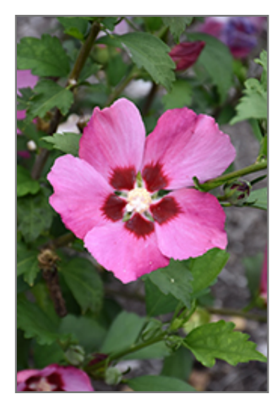
Pink Giant Rose of Sharon flowers

Pink Giant Rose of Sharon is recommended for the following landscape applications;