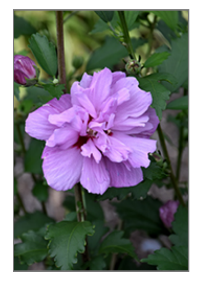
Ardens Rose of Sharon flowers

Ardens Rose of Sharon is recommended for the following landscape applications;