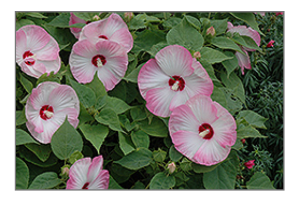
Luna Pink Swirl Hibiscus flowers