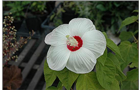
Disco Belle White Hibiscus flowers

Disco Belle White Hibiscus is recommended for the following landscape applications;