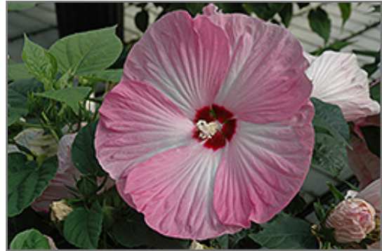
Carolina Pink Hibiscus flowers

Other Names: Rose Mallow, Hardy Hibiscus