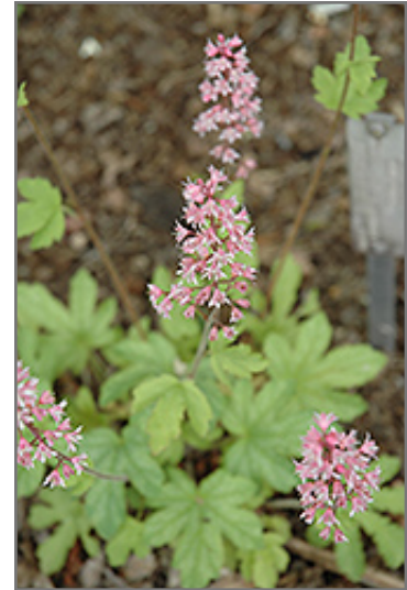
Viking Ship Foamy Bells flowers