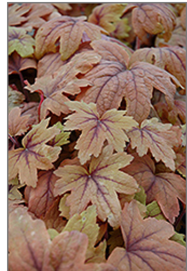
Sweet Tea Foamy Bells foliage