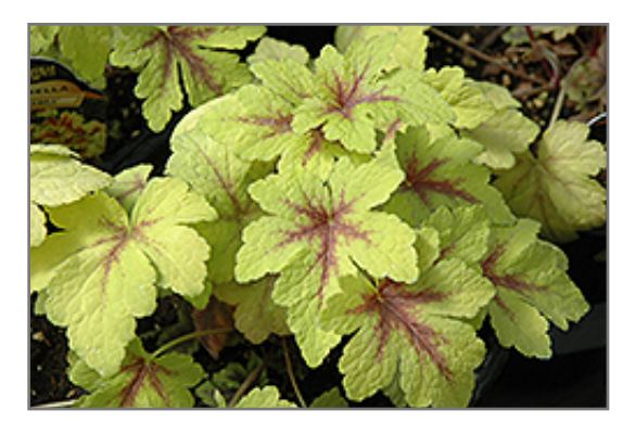
Golden Zebra Foamy Bells foliage