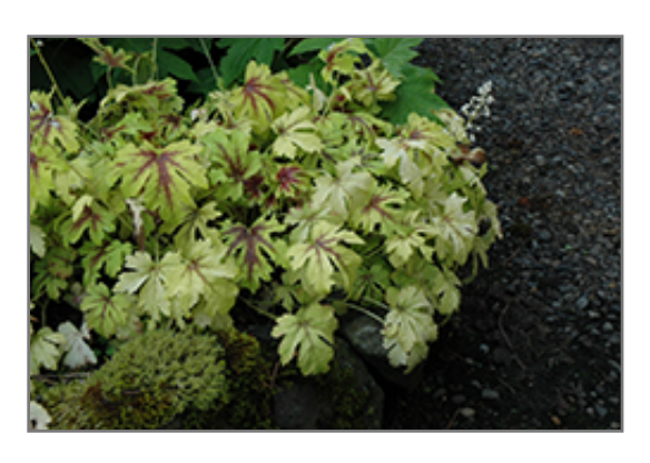
Golden Zebra Foamy Bells

Golden Zebra Foamy Bells is primarily valued in the garden for its distinctive form, with the flower stalks towering over the foliage. It features dainty spikes of creamy white bell-shaped flowers rising above the foliage from mid spring to mid summer. The flowers are excellent for cutting. Its attractive deeply cut lobed leaves remain gold in colour with distinctive red veins throughout the year. The black stems can be quite attractive.