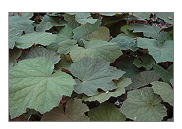
Brownies Coral Bells foliage

Tiny cream bells rise from mounds of enormous chocolate foliage, tinged with green with bright plum undersides; keep soil moist in heat of summer