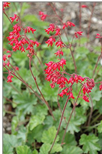
Ruby Bells Coral Bells flowers

Ruby Bells Coral Bells is recommended for the following landscape applications;