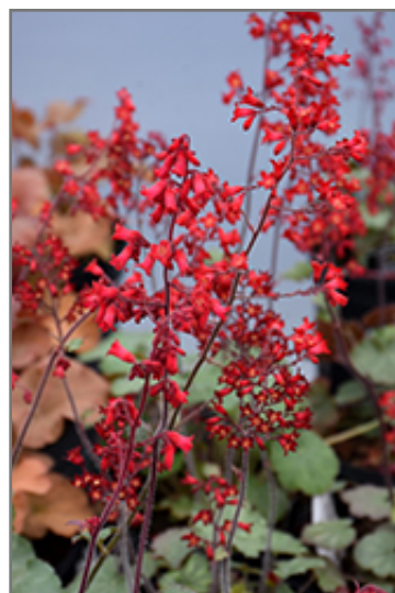
Ruby Bells Coral Bells flowers