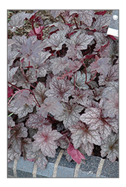
Purple Sails Coral Bells foliage