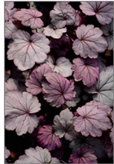
Sugar Plum Coral Bells foliage

Sugar Plum Coral Bells is recommended for the following landscape applications;