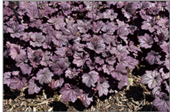
Sugar Plum Coral Bells

Sugar Plum Coral Bells will grow to be about 12 inches tall at maturity extending to 24 inches tall with the flowers, with a spread of 18 inches. When grown in masses or used as a bedding plant, individual plants should be spaced approximately 15 inches apart. Its foliage tends to remain dense right to the ground, not requiring facer plants in front. It grows at a medium rate, and under ideal conditions can be expected to live for approximately 10 years. As an evergreen perennial, this plant will typically keep its form and foliage year-round.