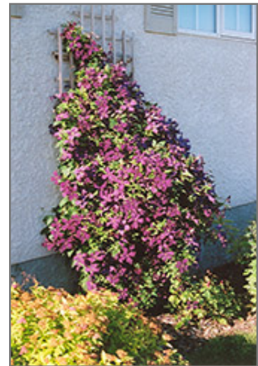
Polish Spirit Clematis in bloom