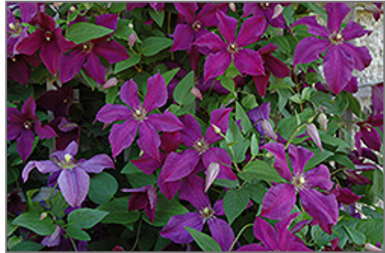
Polish Spirit Clematis flowers