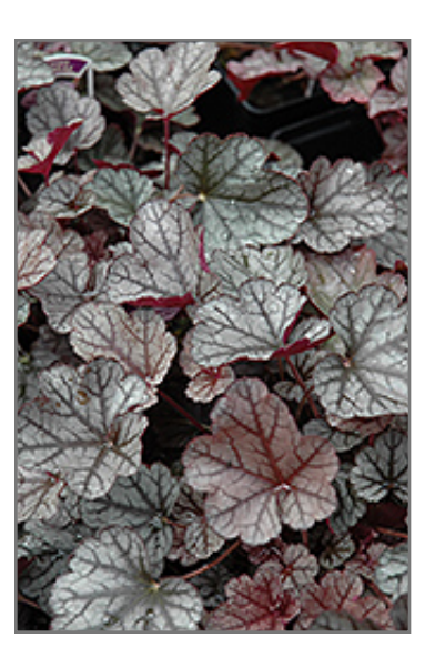
Silver Scrolls Coral Bells foliage

Creamy bells rise from compact mounds of silvery and purple foliage with dark purple and green veins; amazing contrast to other plants; great versatility; keep soil moist in heat of summer