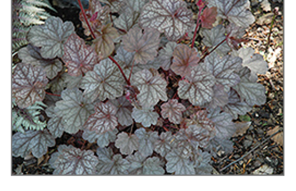
Regina Coral Bells foliage