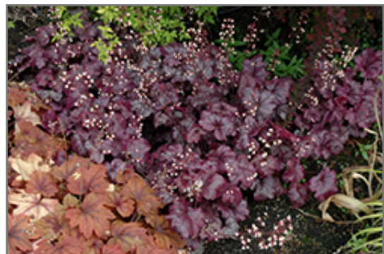
Plum Royale Coral Bells in bloom