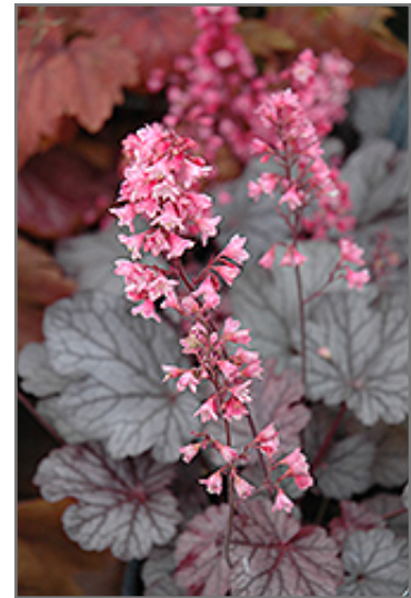
Milan Coral Bells flowers

Milan Coral Bells is recommended for the following landscape applications;