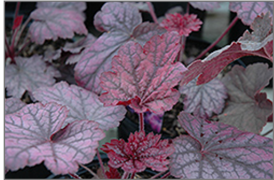
Midnight Bayou Coral Bells foliage

Midnight Bayou Coral Bells is recommended for the following landscape applications;