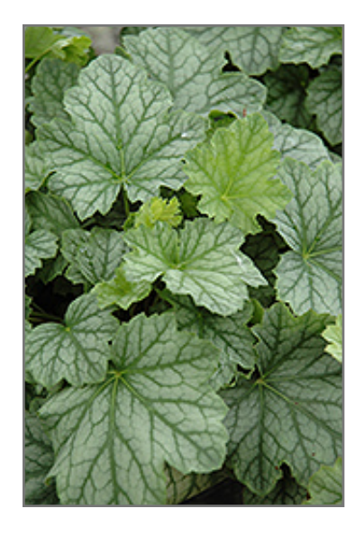
Harvest Silver Coral Bells flowers