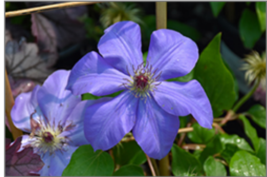
Ramona Clematis flowers