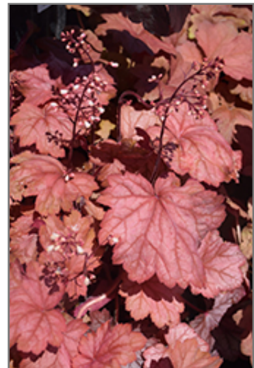
Georgia Peach Coral Bells in bloom