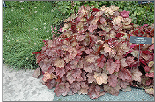
Georgia Peach Coral Bells

Georgia Peach Coral Bells is recommended for the following landscape applications;