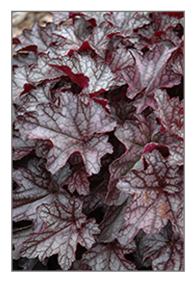
Dolce Black Currant Coral Bells foliage

Dolce Black Currant Coral Bells is a dense herbaceous evergreen perennial with tall flower stalks held atop a low mound of foliage. Its relatively fine texture sets it apart from other garden plants with less refined foliage.