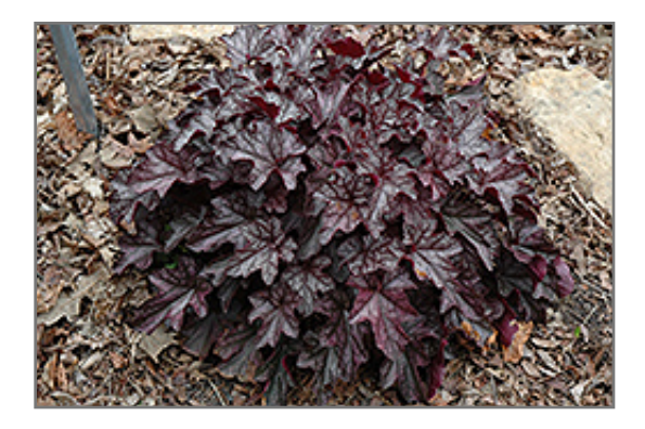
Dolce Black Currant Coral Bells

This is a relatively low maintenance plant, and should be cut back in late fall in preparation for winter. It is a good choice for attracting hummingbirds to your yard. It has no significant negative characteristics.