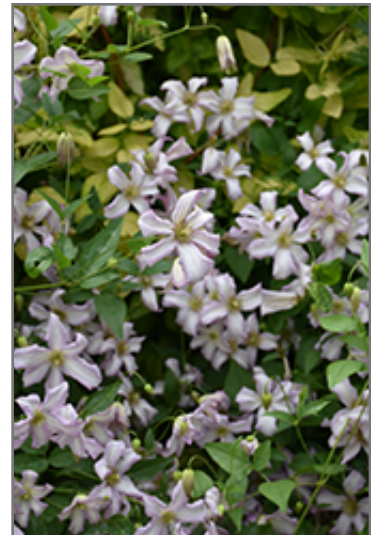
Miss Bateman Clematis flowers