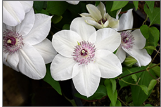
Miss Bateman Clematis flowers

Miss Bateman Clematis is recommended for the following landscape applications;