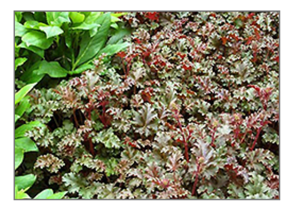
Cafe Ole Coral Bells foliage