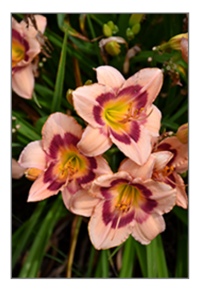
Wineberry Candy Daylily flowers