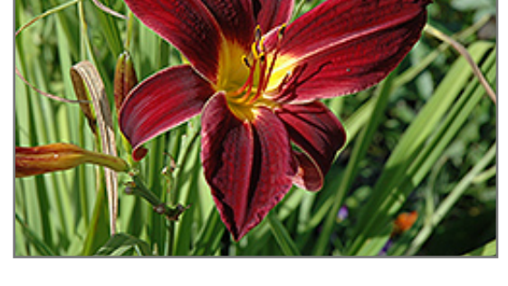
Timbo Daylily flowers