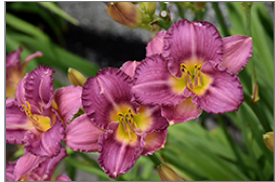
Strutter's Ball Daylily flowers

Large purple blooms with white watermark and yellow throat; midseason bloomer