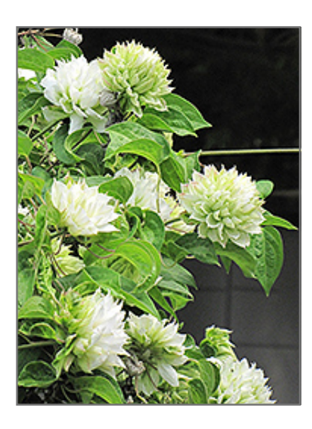
Duchess of Edinburgh Clematis flowers

Duchess of Edinburgh Clematis features showy semi-double white star-shaped flowers with light green eyes at the ends of the branches in early summer. It has green deciduous foliage. The compound leaves do not develop any appreciable fall colour.