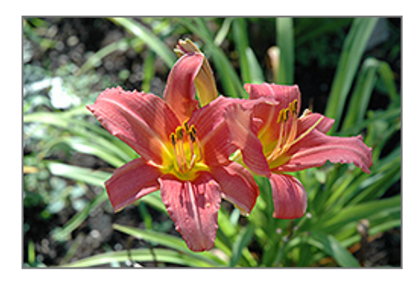
Naomi Ruth Daylily flowers