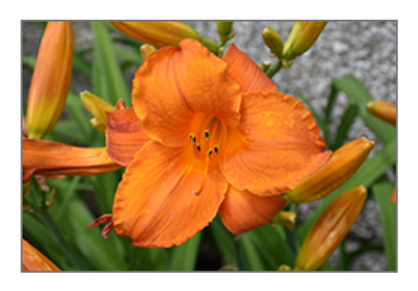
Mauna Loa Daylily flowers