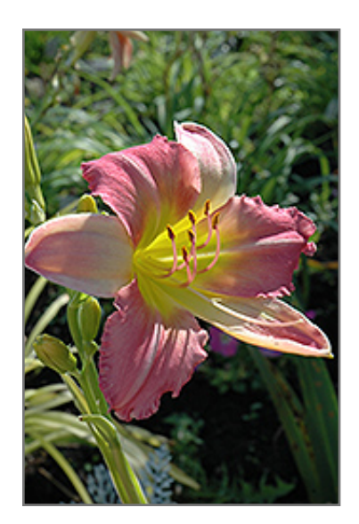
Altamira Daylily flowers