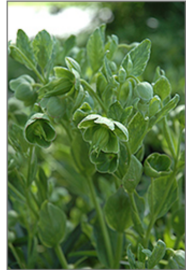
Stinking Hellebore flowers