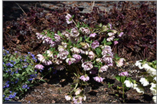
Peppermint Ice Hellebore in bloom