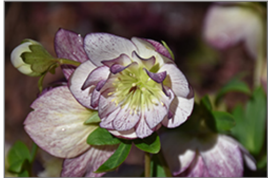
Peppermint Ice Hellebore flowers

Peppermint Ice Hellebore is an herbaceous evergreen perennial with an upright spreading habit of growth. Its medium texture blends into the garden, but can always be balanced by a couple of finer or coarser plants for an effective composition.