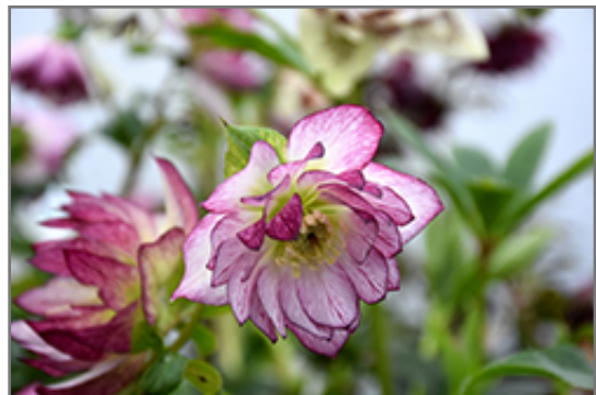
Peppermint Ice Hellebore flowers