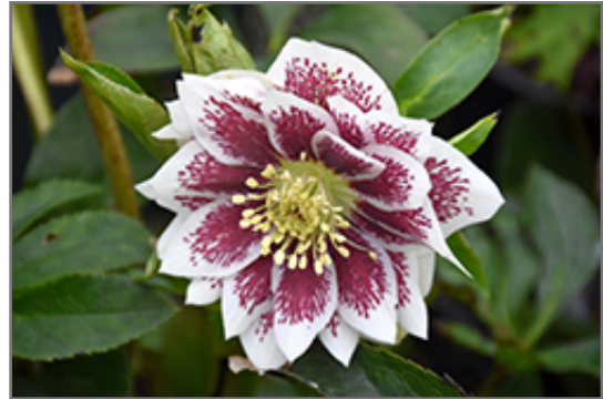
Painted Doubles Hellebore flowers

Painted Doubles Hellebore is recommended for the following landscape applications;