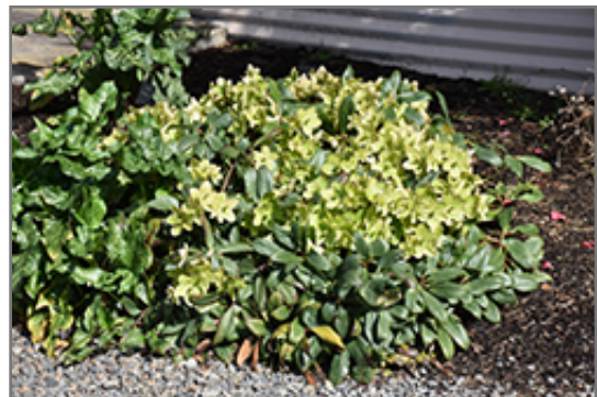
Honeyhill Joy Hellebore in bloom