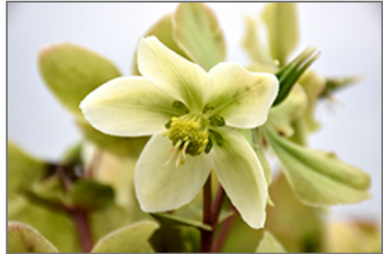
Honeyhill Joy Hellebore flowers

Honeyhill Joy Hellebore is recommended for the following landscape applications;