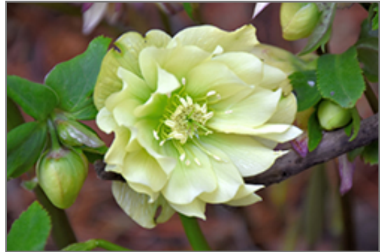
Golden Lotus Hellebore flowers

Golden Lotus Hellebore is recommended for the following landscape applications;