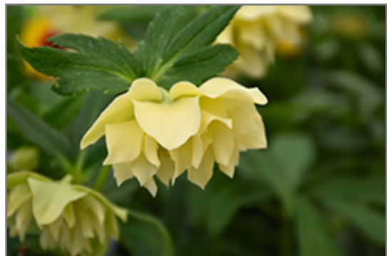
Golden Lotus Hellebore flowers