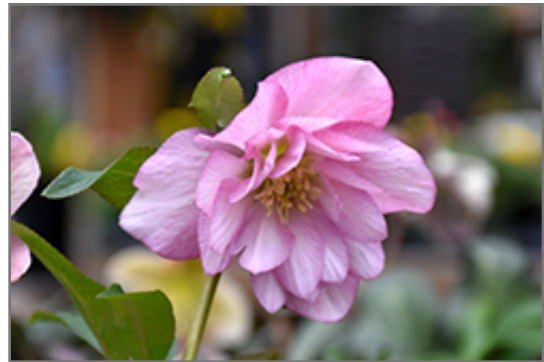
Cotton Candy Hellebore flowers

Cotton Candy Hellebore is recommended for the following landscape applications;