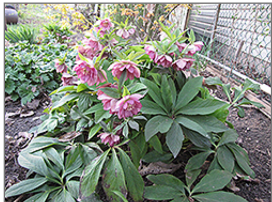
Berry Swirl Hellebore in bloom