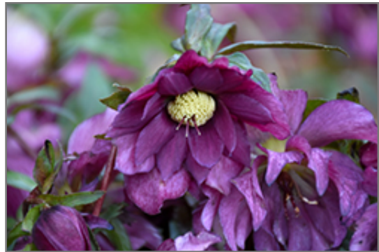
Berry Swirl Hellebore flowers

Berry Swirl Hellebore is recommended for the following landscape applications;