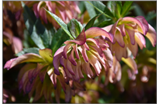
Amber Gem Hellebore flowers

Amber Gem Hellebore is recommended for the following landscape applications;