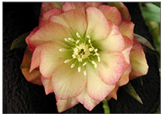
Amber Gem Hellebore flowers