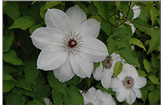
Henryi Hybrid Clematis flowers