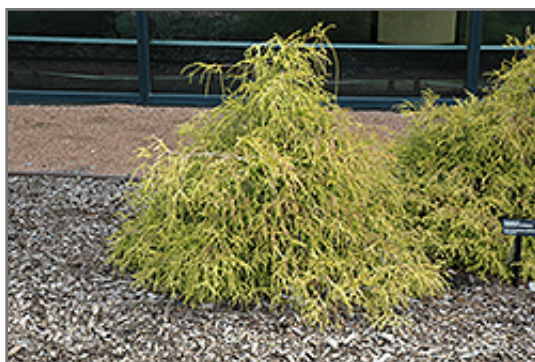
Sungold Falsecypress