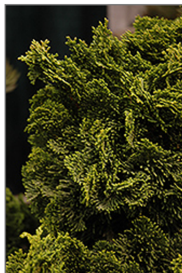
Dwarf Hinoki Falsecypress foliage