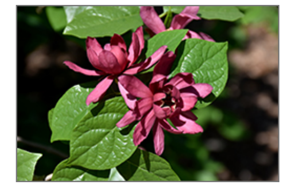
Common Sweetshrub flowers

Common Sweetshrub is a dense multi-stemmed deciduous shrub with a more or less rounded form. Its average texture blends into the landscape, but can be balanced by one or two finer or coarser trees or shrubs for an effective composition.