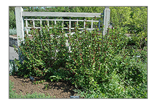
Common Sweetshrub in bloom

This is a relatively low maintenance shrub, and is best pruned in late winter once the threat of extreme cold has passed. Deer don't particularly care for this plant and will usually leave it alone in favor of tastier treats. It has no significant negative characteristics.