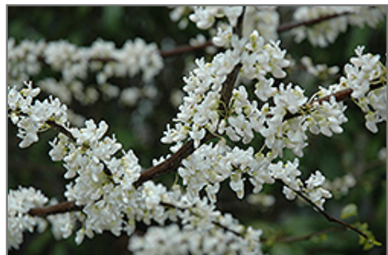
White Redbud flowers