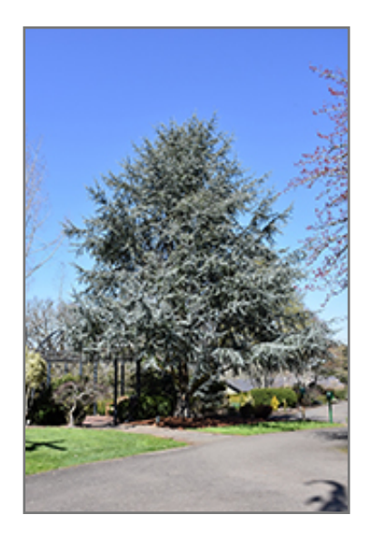
Blue Atlas Cedar