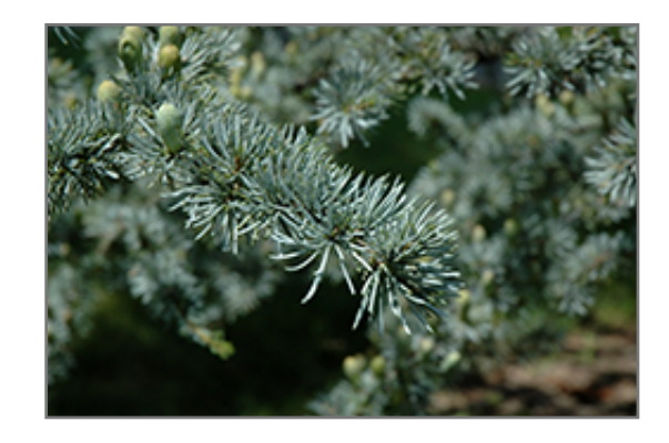
Blue Atlas Cedar foliage