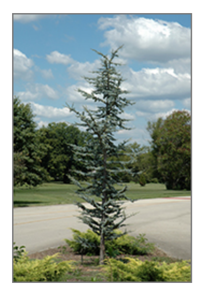
Blue Atlas Cedar

This tree should only be grown in full sunlight. It is very adaptable to both dry and moist growing conditions, but will not tolerate any standing water. It is not particular as to soil type or pH. It is somewhat tolerant of urban pollution, and will benefit from being planted in a relatively sheltered location. Consider applying a thick mulch around the root zone in winter to protect it in exposed locations or colder microclimates. This is a selected variety of a species not originally from North America.