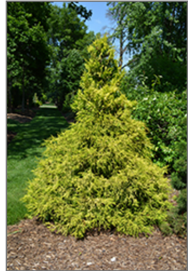
Golden Mop Falsecypress

This is a relatively low maintenance shrub. When pruning is necessary, it is recommended to only trim back the new growth of the current season, other than to remove any dieback. It has no significant negative characteristics.