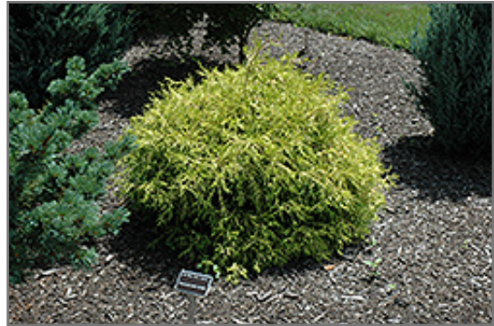
Golden Mop Falsecypress

This shrub does best in full sun to partial shade. It prefers to grow in average to moist conditions, and shouldn't be allowed to dry out. It is not particular as to soil type, but has a definite preference for acidic soils. It is highly tolerant of urban pollution and will even thrive in inner city environments. Consider applying a thick mulch around the root zone in winter to protect it in exposed locations or colder microclimates. This is a selected variety of a species not originally from North America.