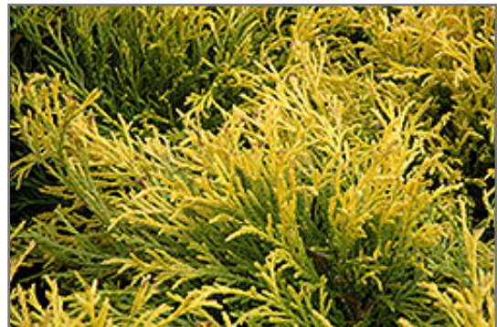
Golden Mop Falsecypress foliage