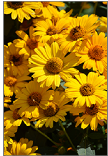
Tuscan Sun False Sunflower flowers

This is a relatively low maintenance plant, and is best cleaned up in early spring before it resumes active growth for the season. It is a good choice for attracting butterflies to your yard. It has no significant negative characteristics.