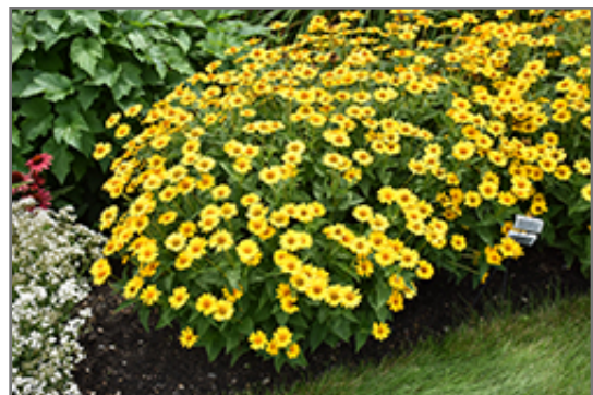
Tuscan Sun False Sunflower in bloom