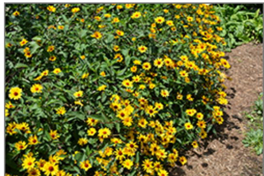
Summer Nights False Sunflower in bloom