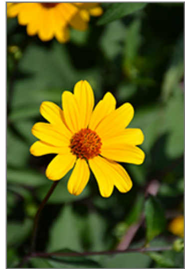
Summer Nights False Sunflower flowers

This is a relatively low maintenance plant, and is best cleaned up in early spring before it resumes active growth for the season. It is a good choice for attracting butterflies to your yard. It has no significant negative characteristics.