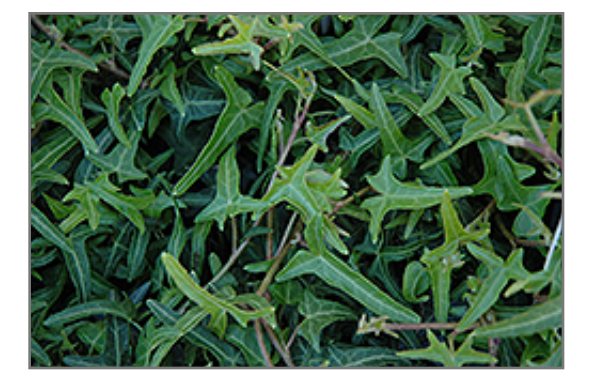
Needlepoint Perfection Ivy